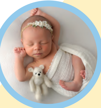
Lauren Parrish Riggs '03 Lyla "Crew" 10/10/20